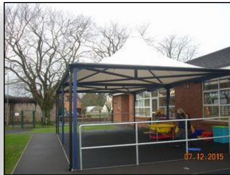
Foundation Stage Play Area