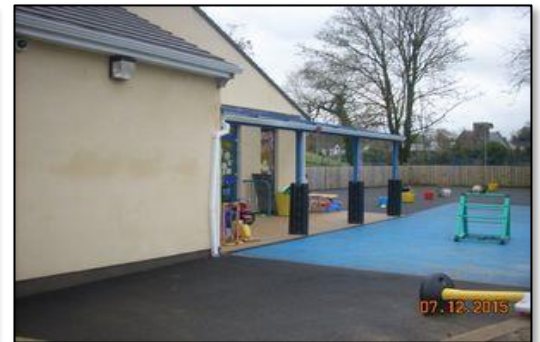
Our Nursery School