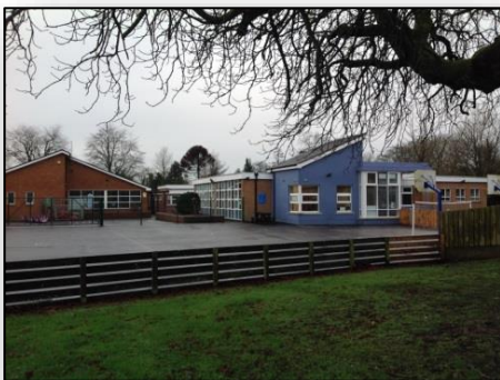
The Primary School

We have an extensive playground, garden areas and a sports pitch including an adventure trail and climbing frame. The Foundation Stage have their own secure outdoor play area with a covered roof that is accessed from our foundation stage classrooms. We have a large, well laid out car park.